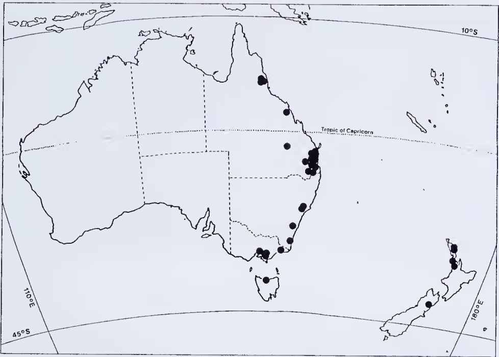
Fig. 3. Australia-New Zealand region showing the distribution of Batrachospermum antipodites .

Creek, Bonang Highway, 15 July 1990, K. Thiele (T. Entwisle 1664) (MEL); Sassafras Creek, Monbulk-Emerald Road, 24 Mar. 1987, T. Entwisle 1139 (MEL). Tasmania — Cheshunt near Deloraine, Feb. 1855, D. Lyall s.n. (BM, NSW).